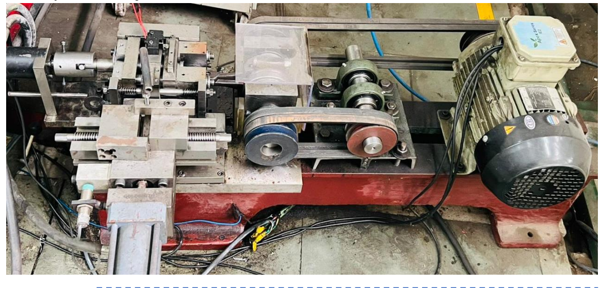
Fig. 3: Linear Friction Welding Setup

Linear Friction Welding (LFW) is a type of solid-state welding in which a joint is obtained by linearly moving one part and pressing it against another part that is kept stationary. The resulting friction heats the parts, causing them to forge together. An inbuilt machine has been developed by Prof. Arshad Noor Siddiquee. The LFW machine is shown in Fig. 3. The machine has been successfully utilized to join dissimilar materials.