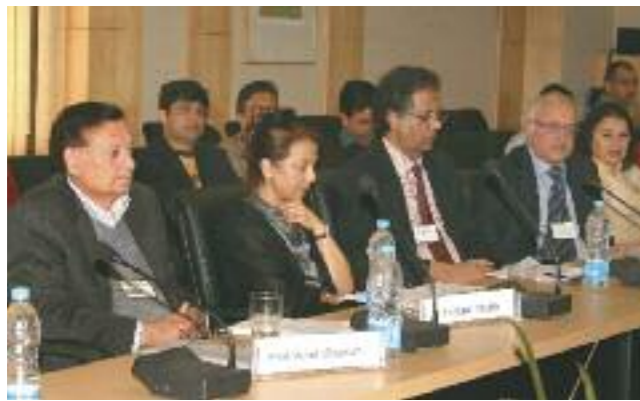
Scholars from Pakistan in a discussion on "The State of Pakistan"

during his time that the State became "an embodiment of punishment", the blasphemy laws were enforced, and the compassion of Islam was eroded.