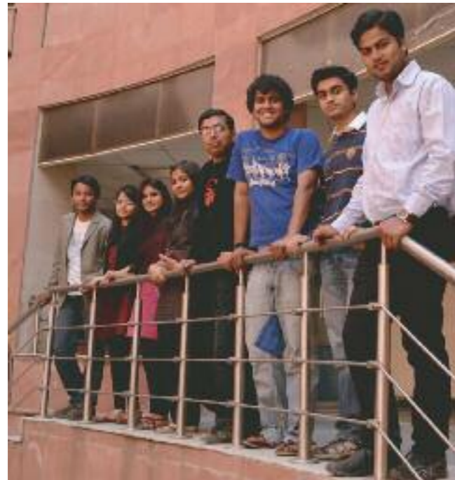
A web of student life: Members of jamiajournal.com