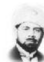
Maulana Mohamed Ali 'Jauhar' Founder, Jamia Millia Islamia