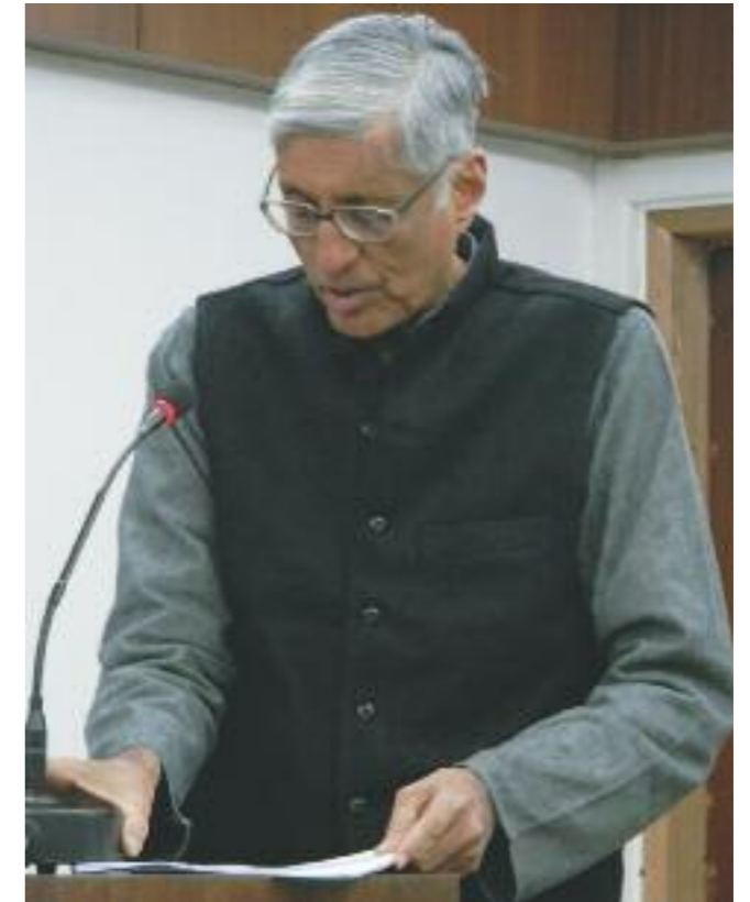
Prof Rajmohan Gandhi speaking about India, Pakistan and Afghanistan

On another occasion, scholars from Pakistan, and of Pakistani origin, discussed the malaise of Pakistan in the context of what its original ideologues and