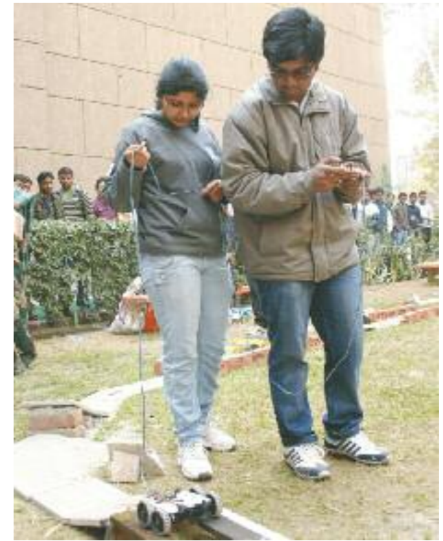
Robots on the prowl: Engineering students demonstrating their ingenuity

Earlier, the Faculty celebrated its silver jubilee in end December, 2010, with a global meet titled Jamia Engineering Alumni Association Conclave — 2010.