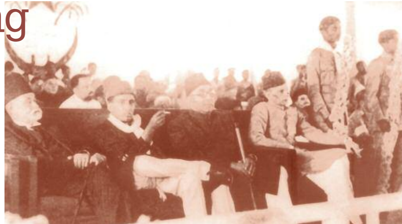
Mohammad Ali Jinnah (right) with Liaqat Ali Khan and other members of the Muslim League at the function

During the Shimla Conference and Cabinet Mission meetings, Jinnah had adopted a stubborn approach that just as the Muslim League represented only the Muslims, the Congress represented only the Hindus, and should, therefore, send only a Hindu representative. The Congress had objected, saying it was the prerogative of the Congress to decide who should represent it. It suggested Maulana Azad's