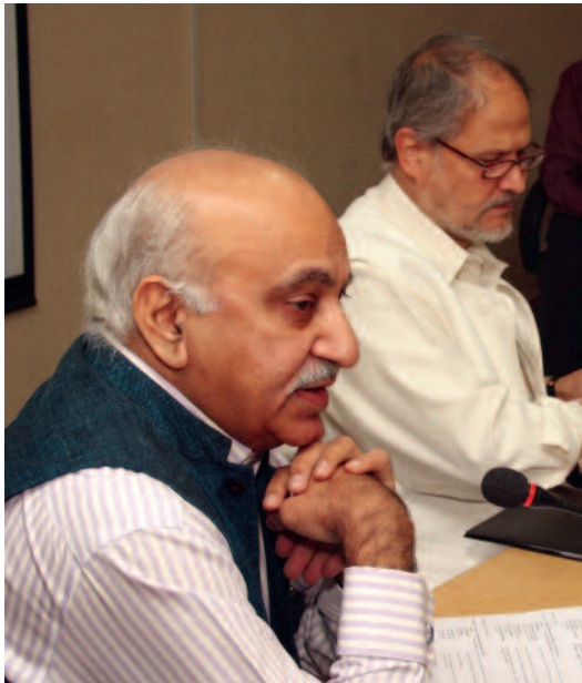
Journalist MJ Akbar at the event on Pakistan

A t a time when Pakistan grapples with turmoil, can its youth restore balance? Research scholars from Jamia and other universities reflected on this issue at a recently held conference ‘Understanding Pakistan’, organised by the Pakistan Studies Programme, Academy of International Studies, Jamia. Scholars presented papers on all dimensions of present-day Pakistan — US-Pakistan and India-US relations, fundamentalism and Islamisation, edu-