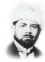
Maulana Mohamed Ali 'Jauhar' Founder, Jamia Millia Islamia