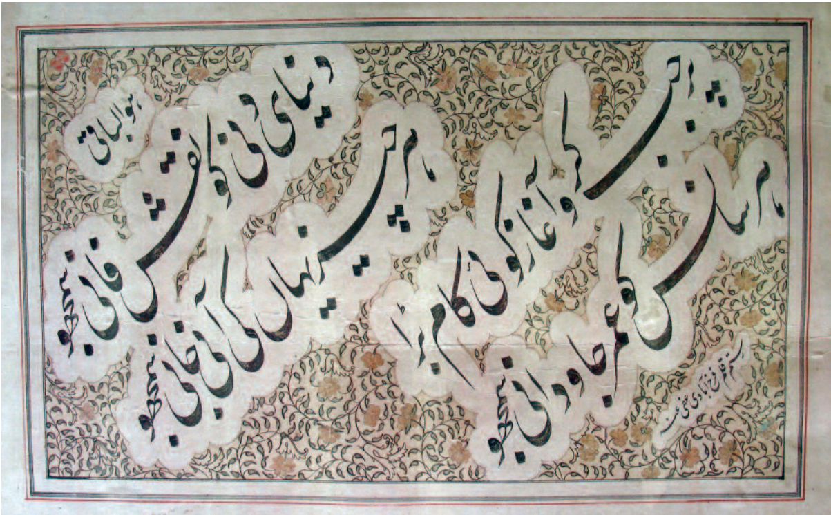
Back to where it belonged: One of the priceless pieces of calligraphy gifted to Jamia by the author

tional books and expresses sorrow about a fire that had burned down the press. Gandhiji wrote the letter in Urdu and mailed it to my father in an envelope he had himself made!