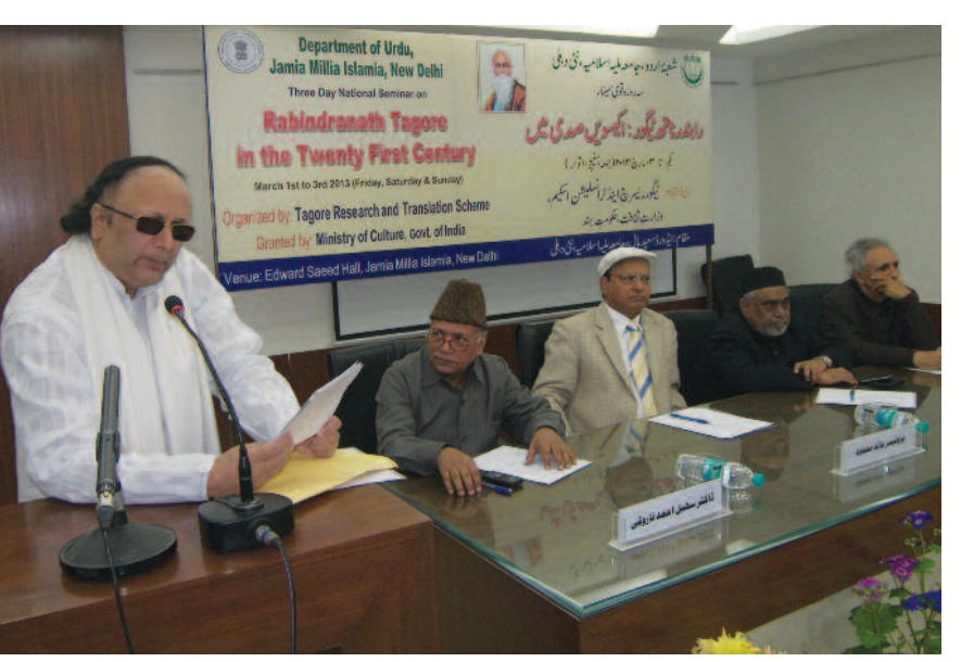
In gratitude to Gurudev: Panelists at the national seminar on Rabindranath Tagore

Seminar on 'Rabindranath Tagore in the Twenty First Century' at the Department of Urdu