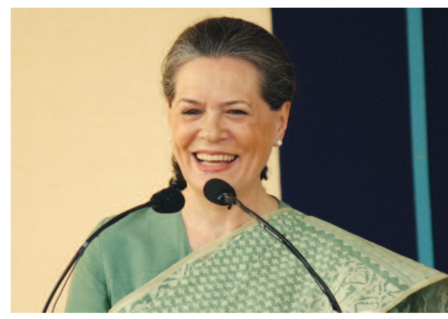
When humour wins the day: Gandhi cracking a joke with students during her speech

This hostel is an important step and I hope that building on this initiative, the authorities will create more infrastructure that enables more and more young men and women to enter the portals of this renowned University.