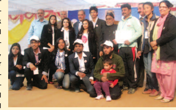
Solidarity in service: Jamia's NSS students during the camp in Jodhpur

THE NSS volunteers of Jamia Millia Islamia took part in the 15th All India National Integration Camp, held this year in Jodhpur, Rajasthan. They actively participated in all the cultural activities and promoted the mes-