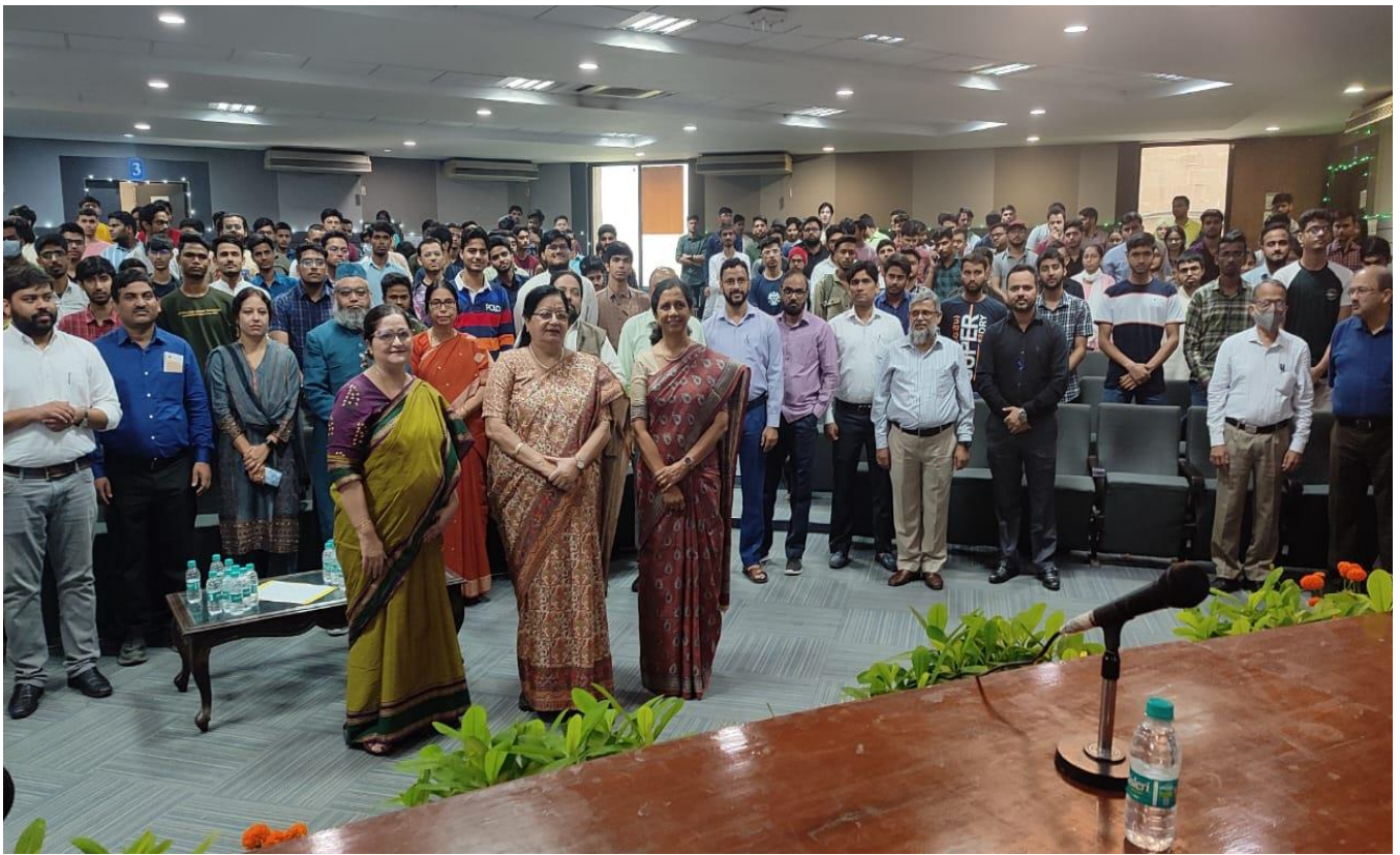
First Year B. Tech. Orientation Program