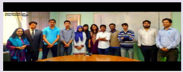
Winners of Centre for Innovation and Entrepreneurship (CIE), Jamia Millia Islamia's "Innovate for a Cause"

In its luminous journey that winds through one startup , two patents, a summer internship programme and several workshops and lectures, a prominent milestone for CIE is most definitely its flagship event- “Innovate for a Cause” .