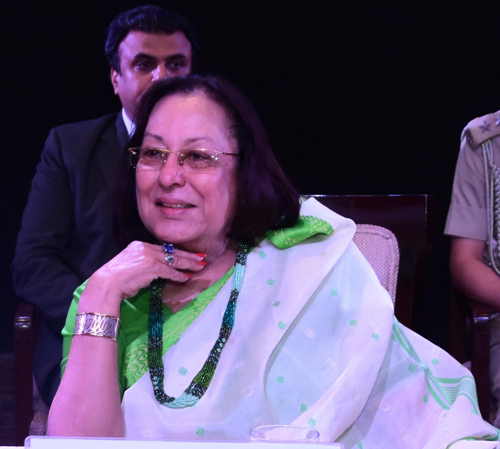
Najma A. Heptulla