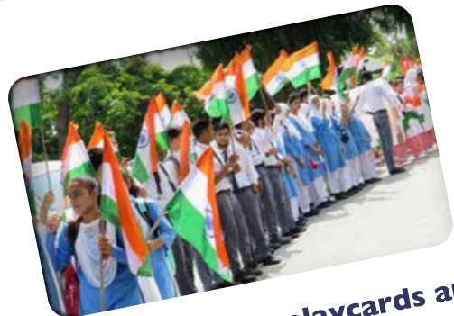
Student holding playcards and Tiranga during Tringa Yatra

Tiranga Yatra was the most exciting March organised by the Jamia Sr. Sec. School, in which students and teachers participated by holding the Tiranga and placards in their hands. The Yatra has been started from the Vice Chancellor's Office and culminated at the Holy Family Hospital.