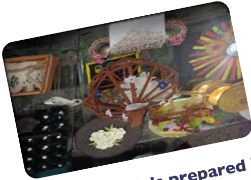
Useful materials prepared by the students from the waste

Students are asked to prepare useful material from the domestic wastes. Beautiful products are prepared by the students.