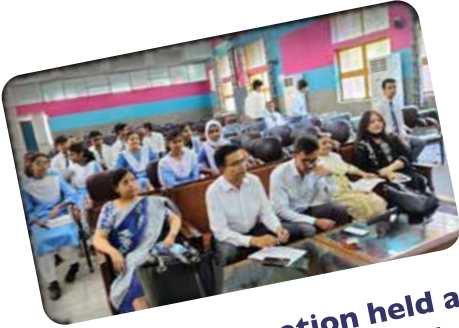
Debate competition held at Jamia Sr. Sec. School

Debate competition was organised on the topic "Plastic: How is it Sustainable for Ecological Balance". The students from class IX to class XII participated in the debate competition. Following students grabbed the positions.