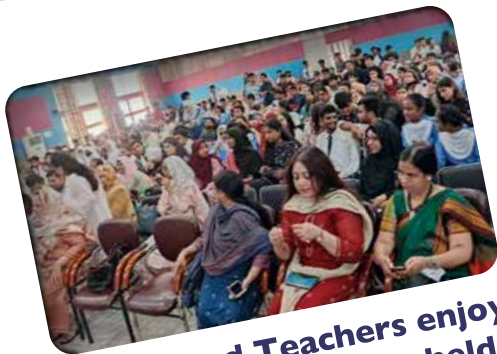
Students and Teachers enjoying the cultural programme held on the occasion of Teachers Day

Teachers Day was celebrated on 5 th September. On the occasion school was handed over to the students to enhance their leadership skills. Teaching and administrative activities were conducted by the students. After completion of five periods, a cultural programme was organised by the students at the MPH-JSSS.