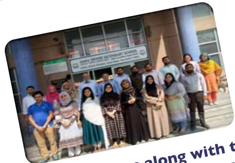
Guest teachers along with the Principal & Vice-Principal