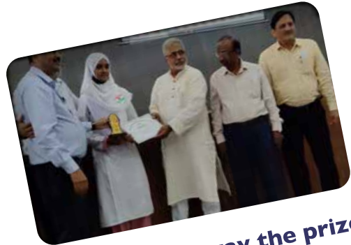
Judges giving away the prizes to the winning participants