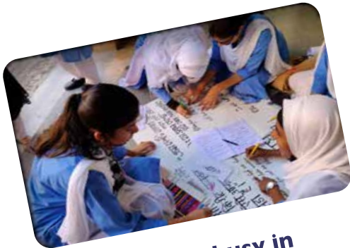
Students busy in making Posters

Under the aegis of Fine arts department poster making competition were conducted.