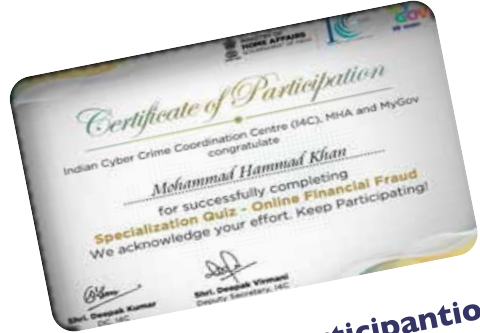
Certificate of participation in Quiz

This event was also organised to celebrate the Azadi ke Amrit Mahotsav. This was an online quiz competition where large number of students participated.