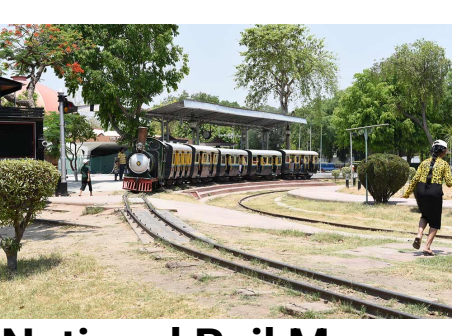
National Rail Museum