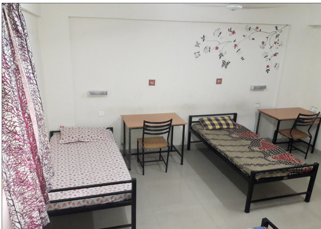
Residents' Room (Triple Seaters)