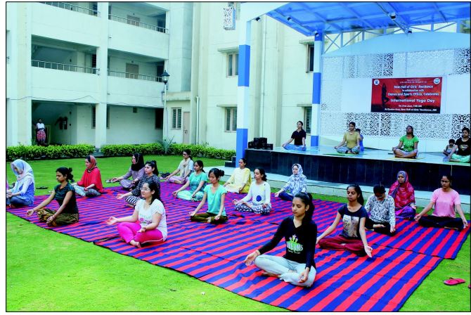
Yoga Day 2017