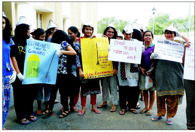
Swacchta Abhiyaan 2017