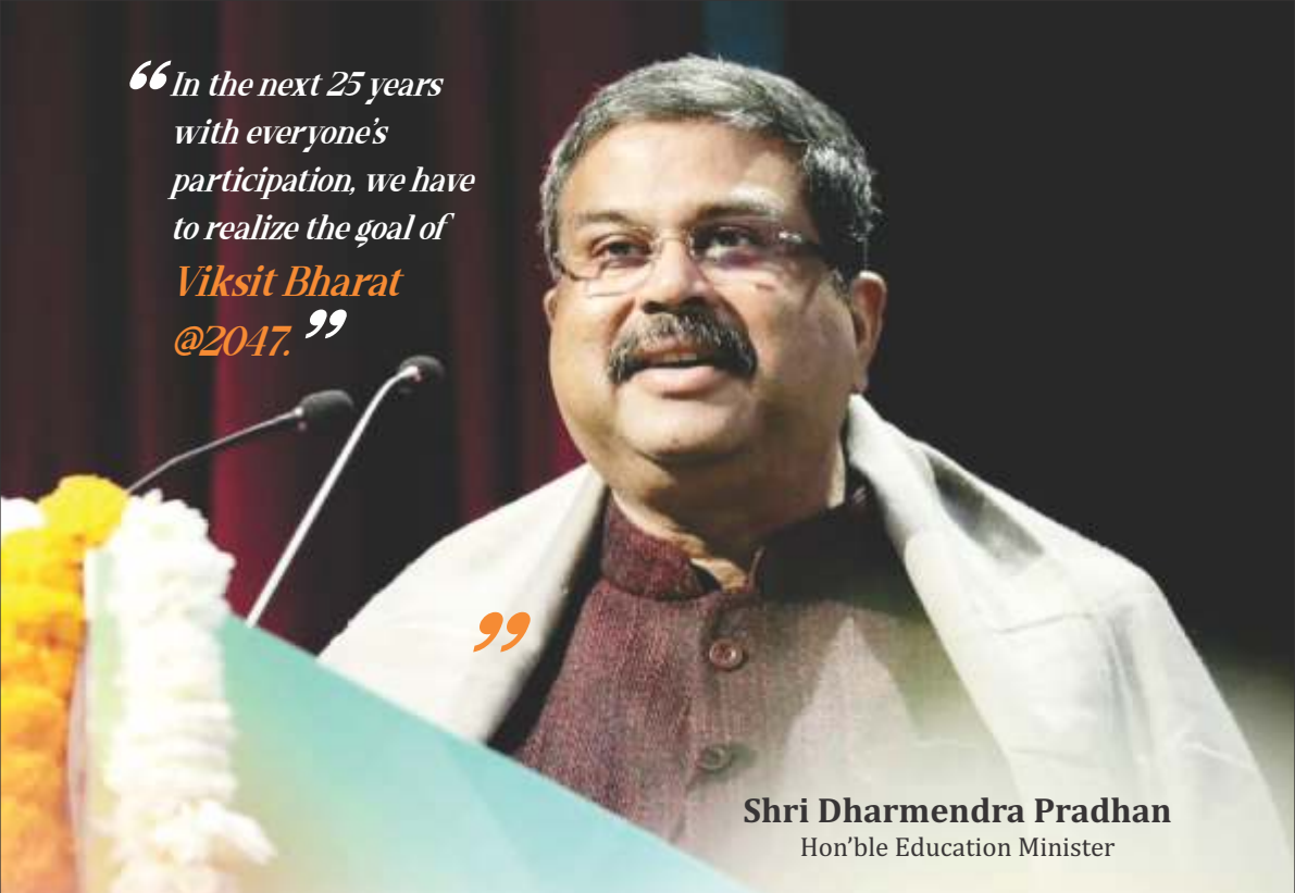
Shri Dharmendra Pradhan Hon'ble Education Minister

“In the next 25 years with everyone’s participation, we have to realize the goal of Viksit Bharat @2047.”