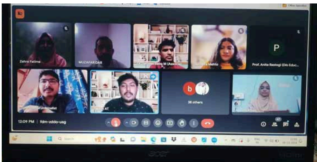
Photo: Virtual Talk conducted on zoom platform