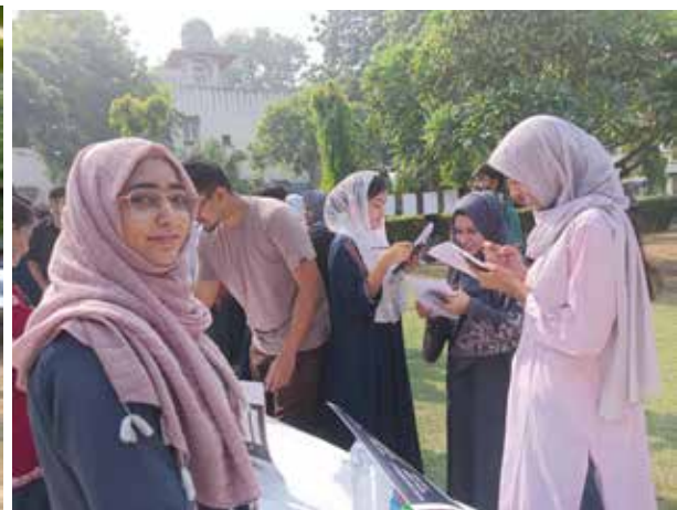
Photo: Volunteering Psychological Testing