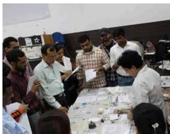
Photo: Resource Person engaged in an experiment