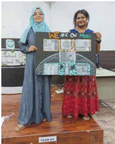
Photo: Participants showing their Collage