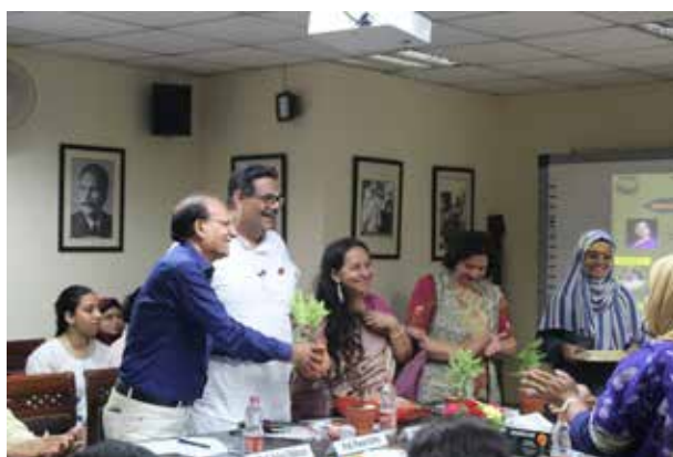
Photo: Guest Felicitation