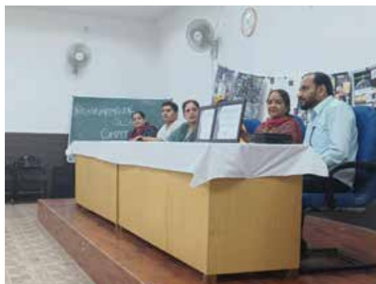
Photo: Prize Distribution