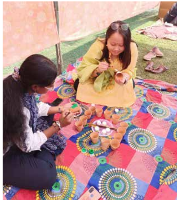
Photo: Students enjoying 'Paint a Kulhad' activity