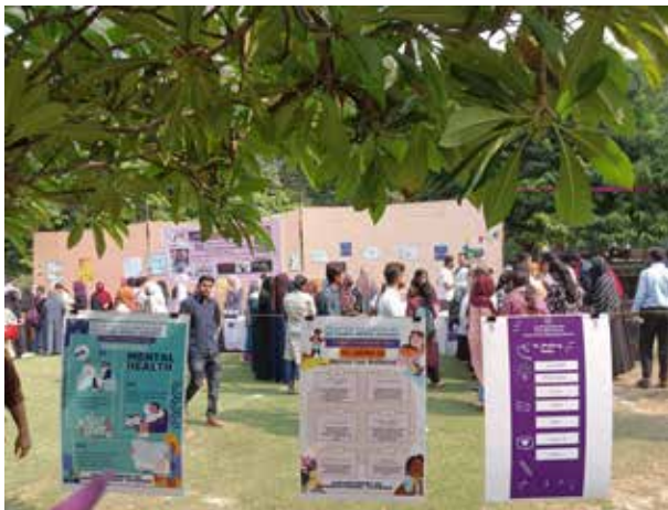
Photo: Teaching Learning Material