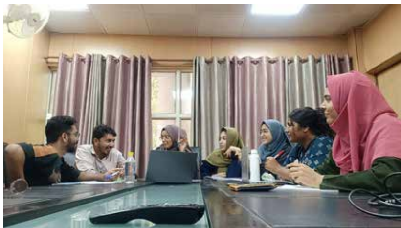
Photo: Conference Room, NIEPA