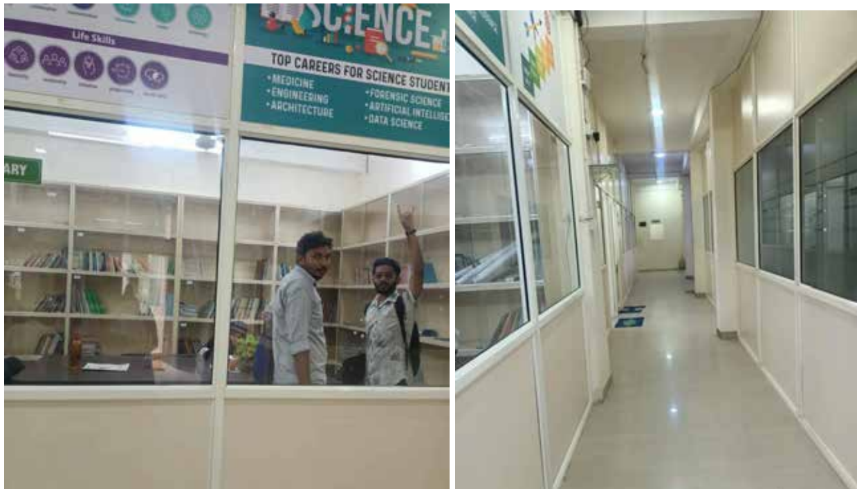
Photo: Centre for Training and Academic Guidance(CTAG) Building, Human Welfare Foundation, Delhi

Our visit to the Human Welfare Foundation (HWF) offered a unique opportunity to delve into the organization's multifaceted approach towards community development in India. Established as a non-profit entity committed to humanitarian causes, HWF's initiatives span across education, healthcare, and social welfare, with a particular focus on marginalized communities. Our primary goal during this visit was to gain a comprehensive understanding of HWF's operations, delve into the core principles guiding their initiatives, and assess the tangible impact of their programs on the communities they serve.