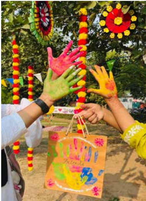
Photos: Students enjoying 'Paint a Bag' activity