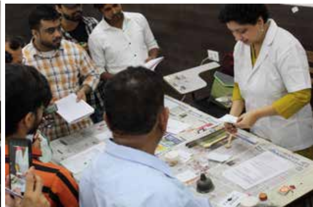
Photo: Participants involving in the experiment