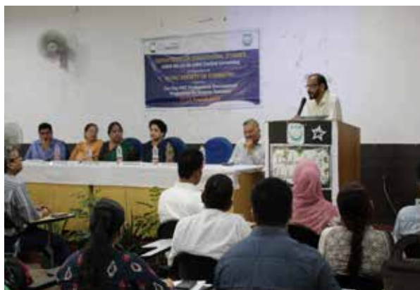
Photo: Inaugural words by Head