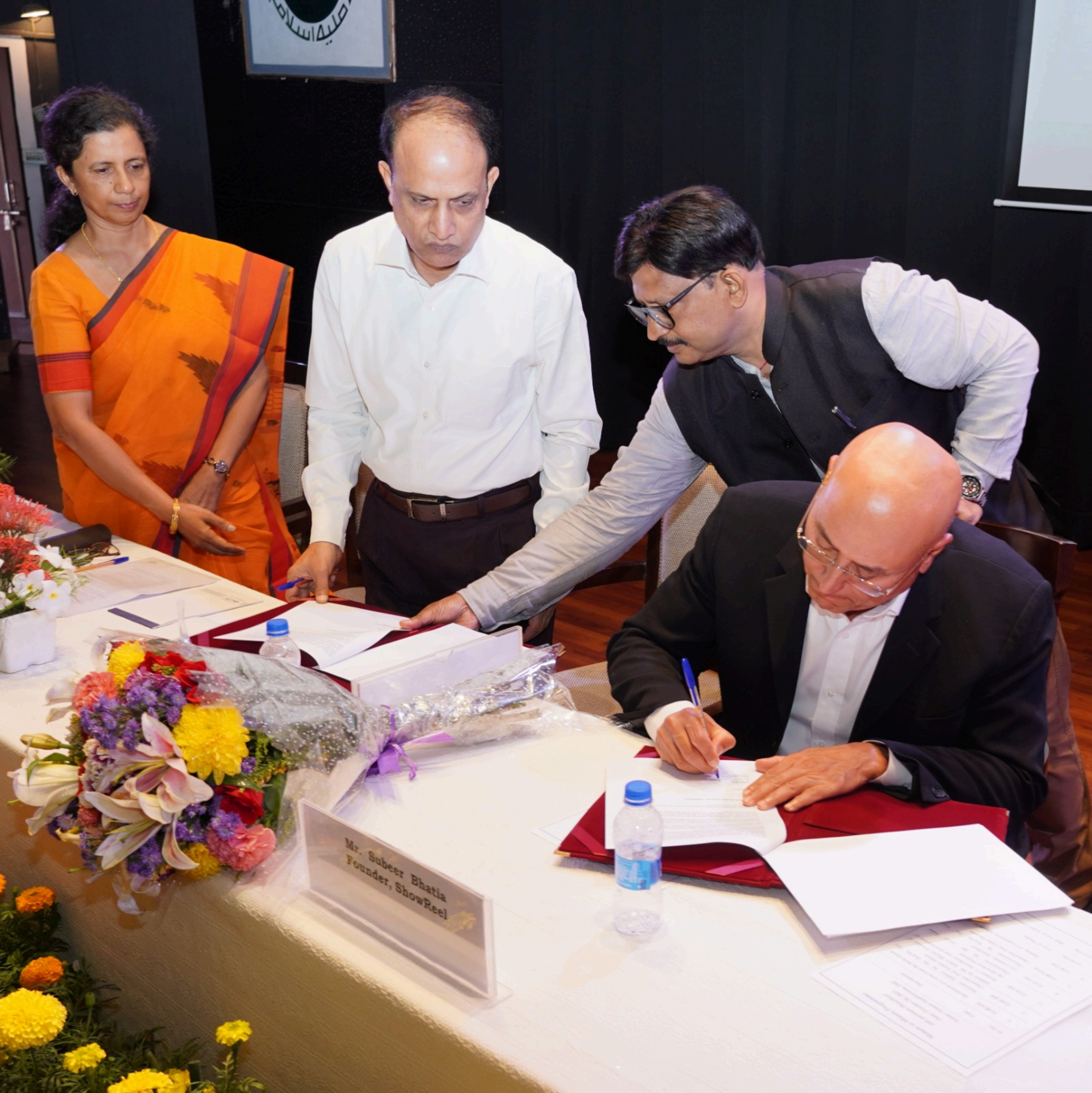
Mr. Subeer Bhatia Founder, ShowReel