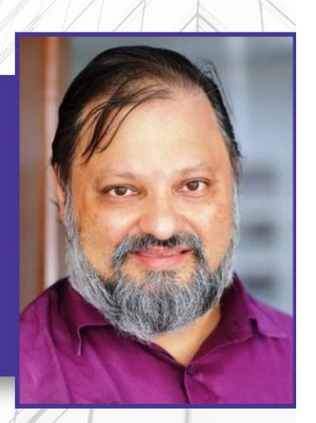
Managing Editor, Indo Asian News Service (IANS) & Co-Editor, The Bloomsbury Handbook of Indian Cuisine.

Delve into the Role of Tourism in Promoting Peace during India's G-20 Presidency in this Event