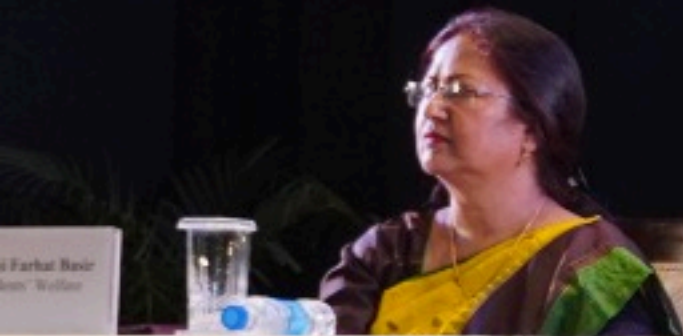
Ms. Sharmila Tagore Inspiration of Jamia