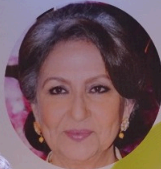
Ms. Sharmila Tagore Inspiration of Jamia